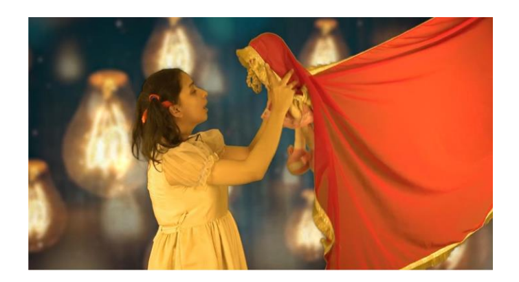
Figure 5 A fancy red piece of cloth appears in the frame and the child starts playing with it too.

The whole setting was established and a little girl was shown freely moving and playing with her doll.