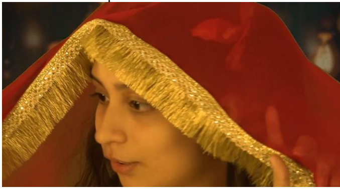
Figure 7 Interval shot: The child wears it and remains unaware of the circumstances