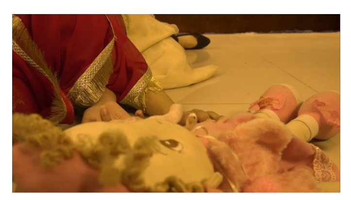
Figure 8 The Final shot revealing her struggle and bad outcomes

The smaller number of shot divisions and angles make this art piece more eye catching and observant.