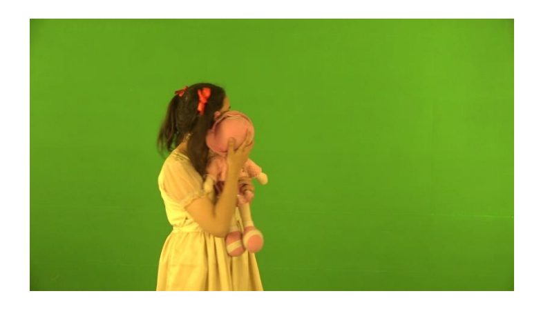
Figure 2 Chroma/ Green screen used in the background

Chroma key was used in the background for recording. Adobe Premiere pro was used for the editing of this video. Furthermore, the audio was also treated in the same software. Lastly, the Urdu text was typed in In page.