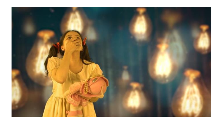
Figure 4 The Establishing shot

Medium shot: Instead of using longer shots, the artist captured medium shots to reveal details on the subject from the very beginning.