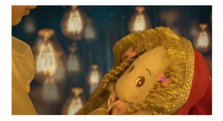
Figure 6 Close-up shot to reveal details of a doll