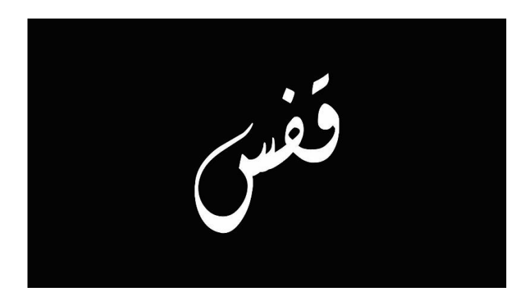
Figure 3 Name of the video typed in Urdu